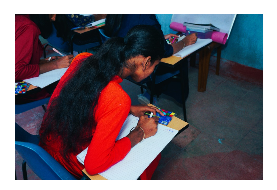
Empowering Dreams, One Stitch at a Time!