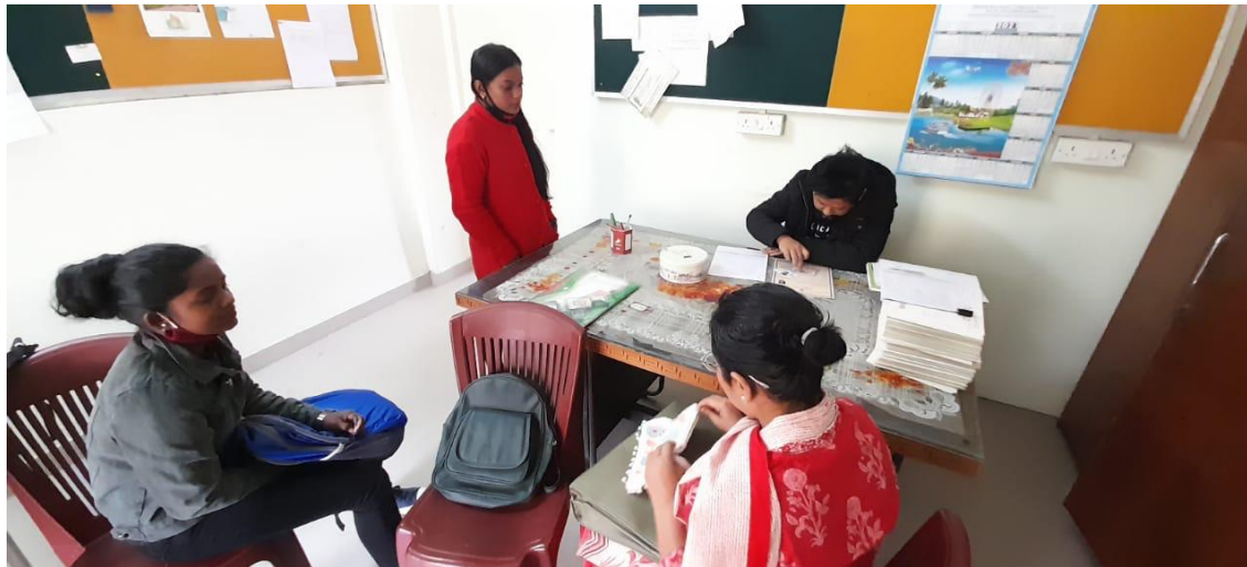
During the admission process in Donbosco training office.